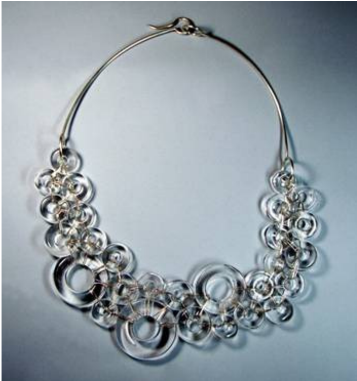
Ether Necklace $2,620