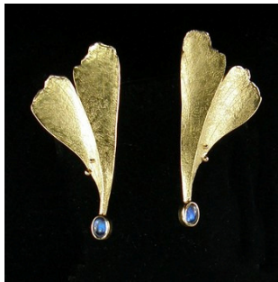
Eve Llyndorah - $2,742