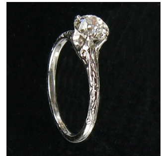
Ring ca 1920 - $6,995