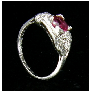
Ring ca 1930 - $3,480