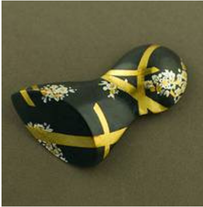
IRIS ALGOM Vancouver

Reflections of human forms and landscapes, Iris calls her work 'sculptures to wear.'