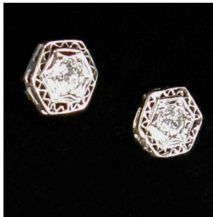
Earrings ca 1920 - $688