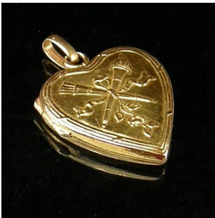
Locket ca 1910 - $581