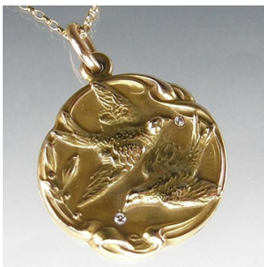
18k Repousse Locket with Diamond accents marked 1909 $988