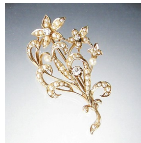
14k & Seed Pearl Pin with Diamond accents ca 1890 $660