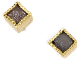
Raw Diamond Earrings set in 18k yellow gold Todd Reed $600