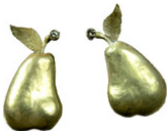
14k Repousse Earrings with Yellow Diamonds Linda Kindler Priest $1,505