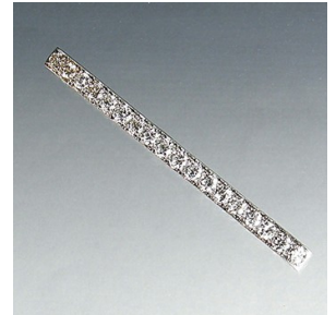
Tiffany & co. Bar Pin Diamonds set in Plat. ca 1910 $6,989.00