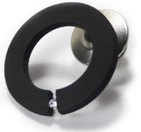
'Crackle' Pin, Steel & tension set Diamond Patrick Malotki $225