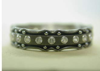
Ring in titanium with 24 Diamonds set in 14k gold Wes Glebe $1,815